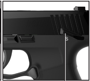
MANUAL SAFETY ON: S SYMBOL Showing